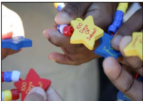
Above: Students show off their 100 Days craft projects. Below: Students at Hilliard take part in a contest to determine who could come the closest to blowing 100 bubbles.